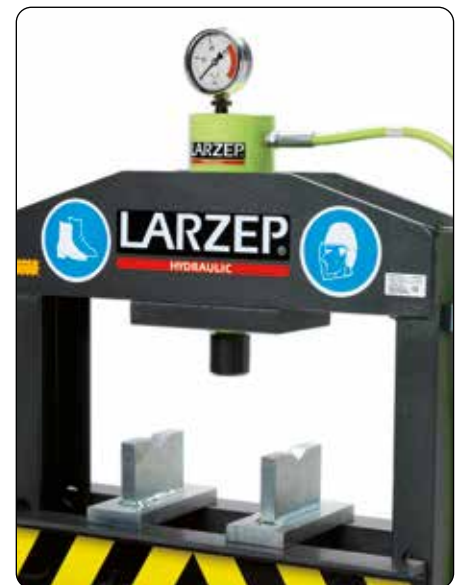
V-blocks and pressure gauge reading in tons are supplied as standard on all models.