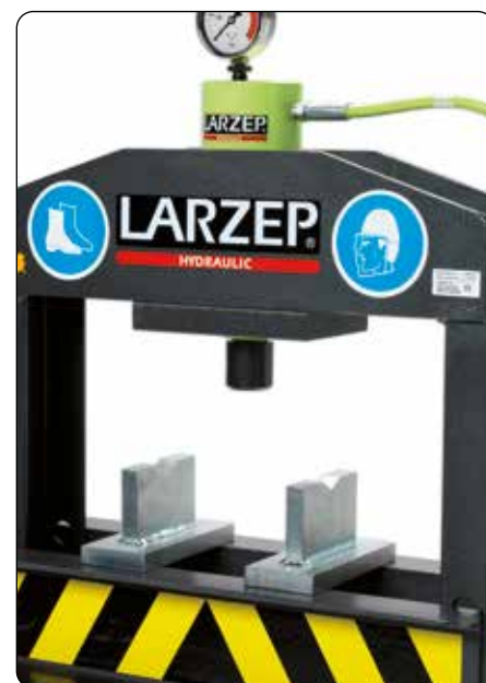
V-blocks and pressure gauge reading in tons are supplied as standard on all models.